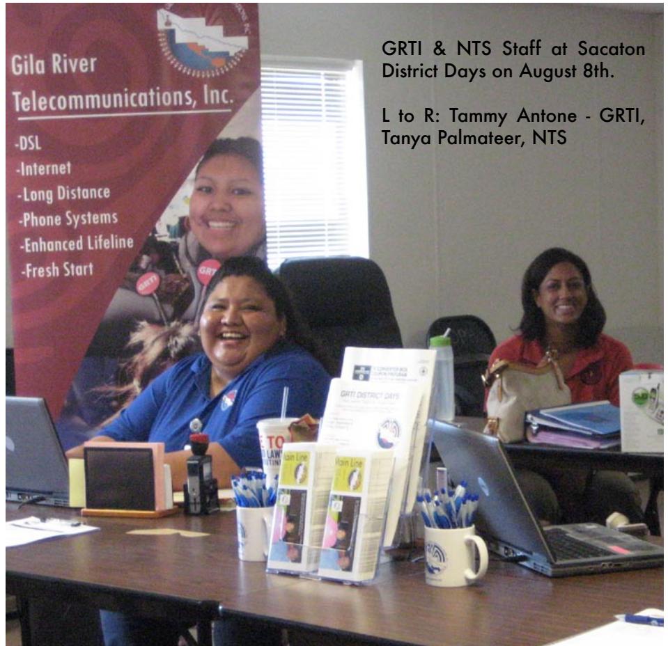
GRTI & NTS Staff at Sacaton District Days on August 8th.