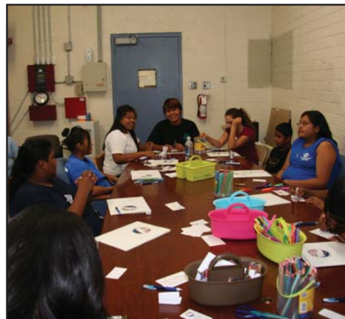
Komatke youth work on their "mini" life plans.