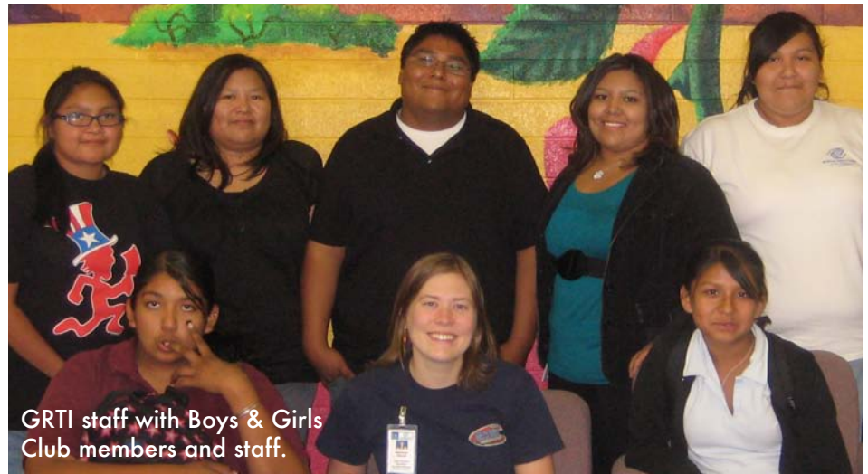
GRTI staff with Boys & Girls Club members and staff.

GRTI feels it is essential for tribal entities to give Gila River youth life skills and encouragement for the betterment of the community. GRTI would like to thank the Komatke Boys & Girls Club for allowing us to present to the teens!