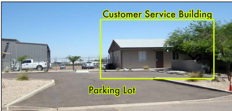
Photo of Customer Service Building where customers will go for any customer service issues as well as make payments.

Drop Box Payments: GRTI will provide an after hours drop box. It is located at the temporary Customer Service Building to the right side of the door. The drop box is checked daily.