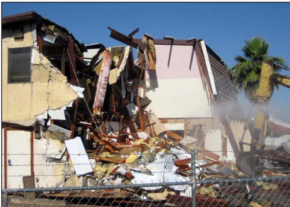
The first step to a new and more convenient parking lot is bringing down the old GRTI building. Temporary customer parking and customer service office is located south of the old building. Taken June 20, 2008.

Thank you for your patience! We are in the final stages of completing GRTI's move to the new building!